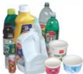
Plastics with recycling symbols #1-#7