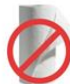
Paper towels, used paper plates/cups