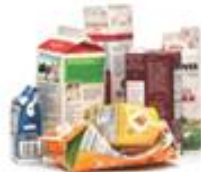
Milk containers, juice cartons (non-waxed)