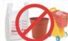
Plastic bags, un-numbered plastics, shrink wrap, flexible plastic wrap