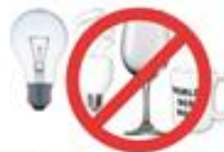
Light bulbs, mirrors/window or auto glass, ceramics/porcelain, glass cookware/bakeware