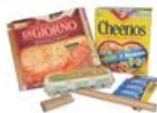
Food boxes, paper egg cartons, tubes from paper towels/toilet paper