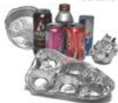
Aluminum cans, aluminum foil, tin pie pans, tin food cans