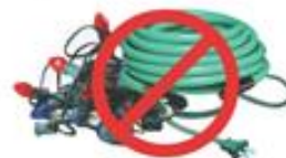
Electric cords, Christmas lights, garden hoses