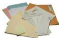
Folders, colored and white office paper