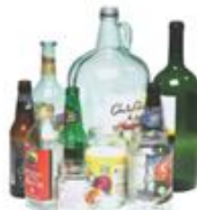
Glass food & beverage containers