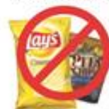
Snack packaging, photo paper, waxed paper