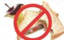
Food waste, liquids