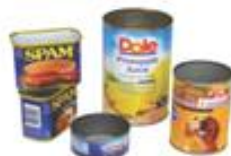
Steel or metal food containers and cans