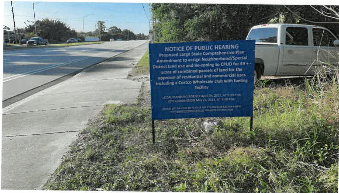
Sign 2- Southside