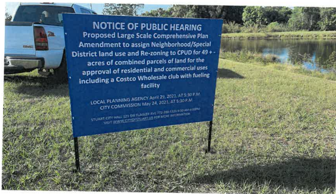
Sign 1– Southside