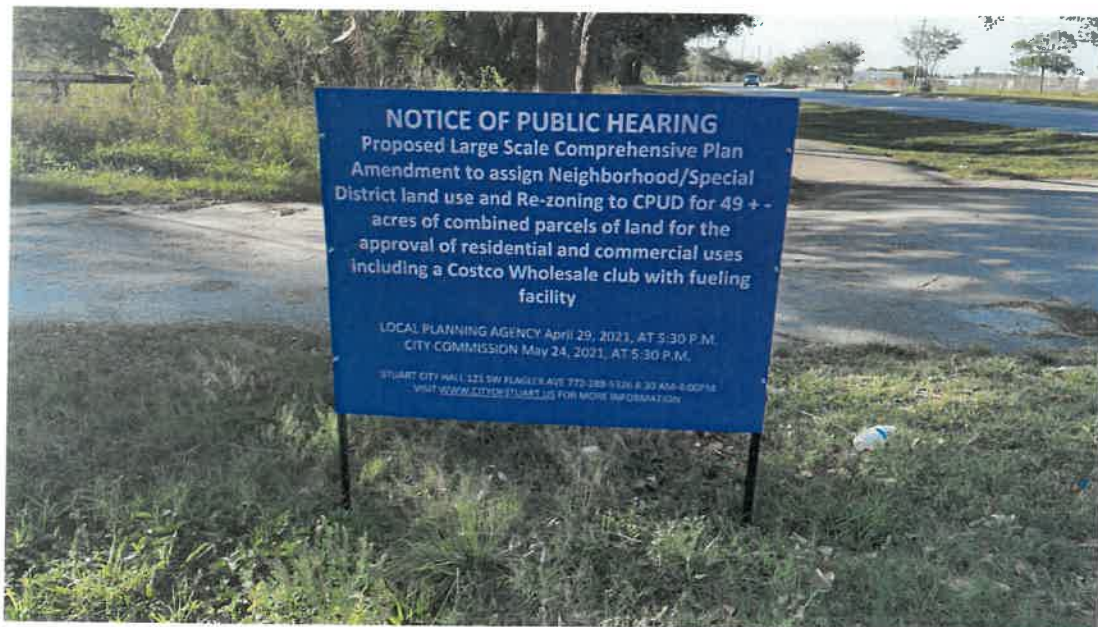
Sign 4- Southside