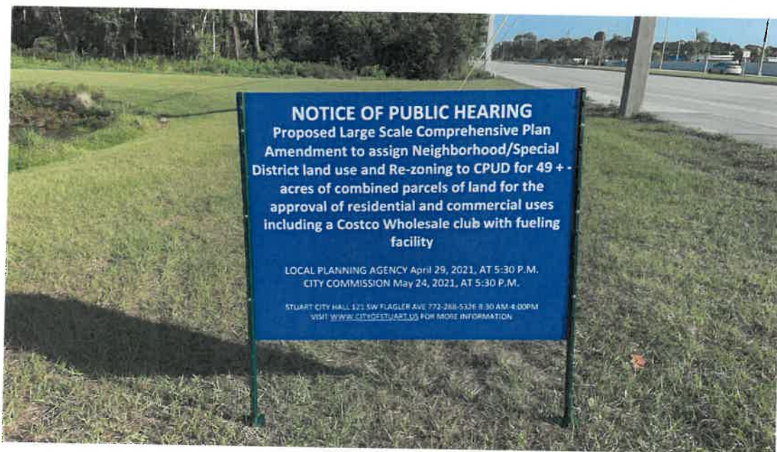
Sign 1- Northside