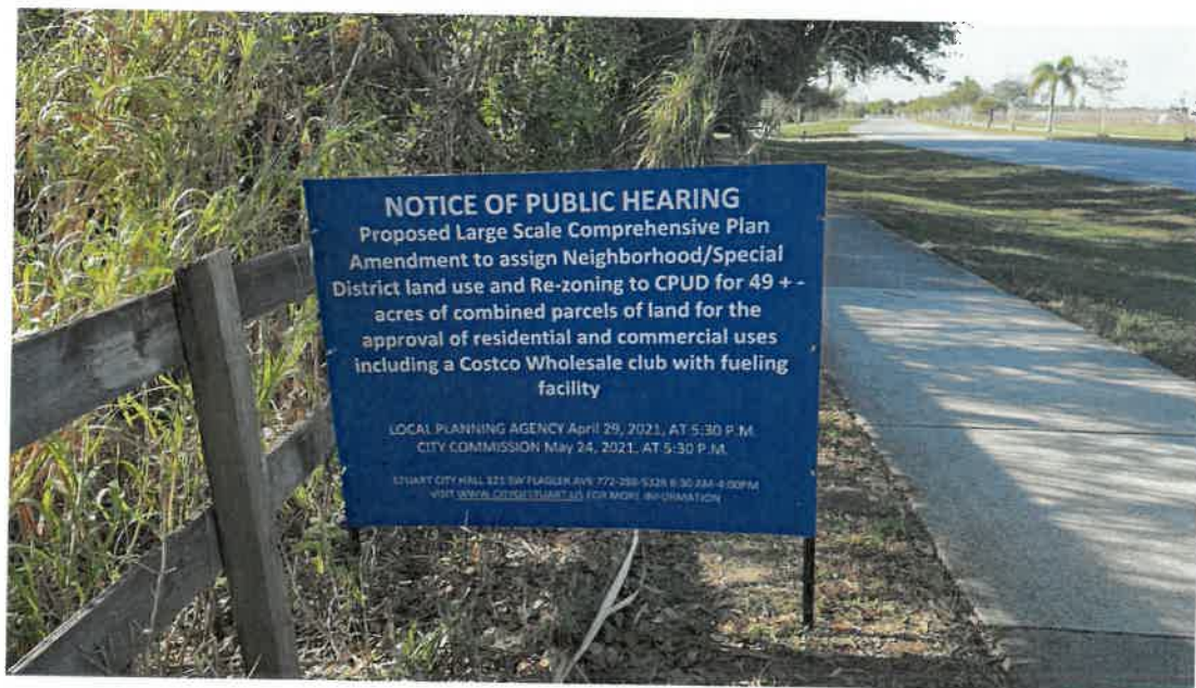
Sign 3— Southside