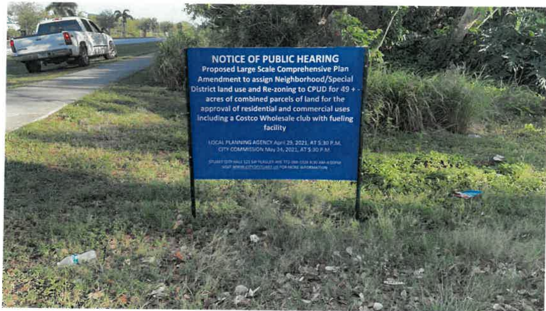
Sign 4- Northside