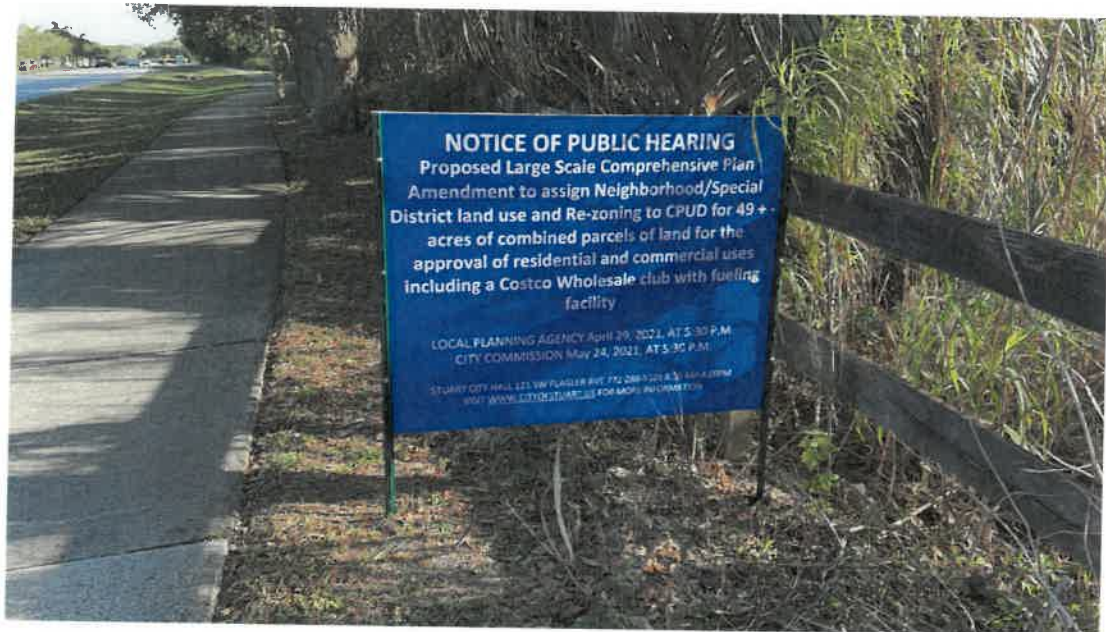
Sign 3- Northside