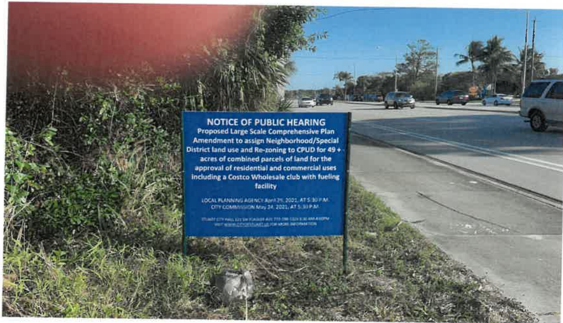
Sign 2- Northside