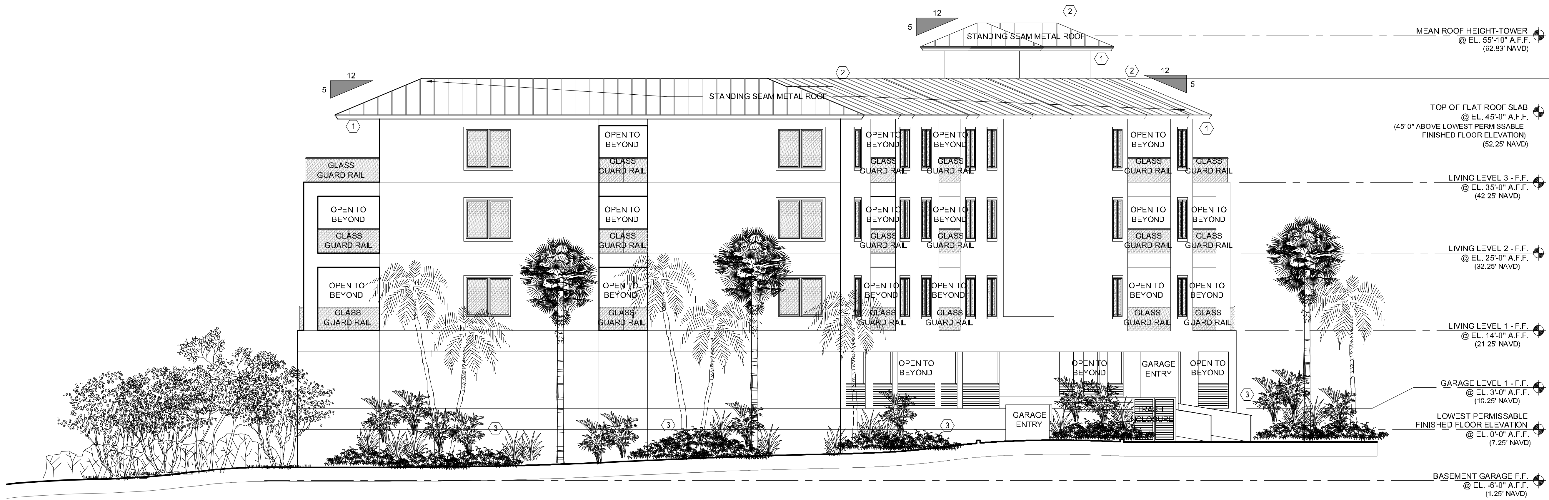
NORTH BUILDING ELEVATION D SCALE: 1/8" = 1'-0" A-2.02

12.08.2020 - SITE PLAN APPROVAL SET - NOT FOR CONSTRUCTION